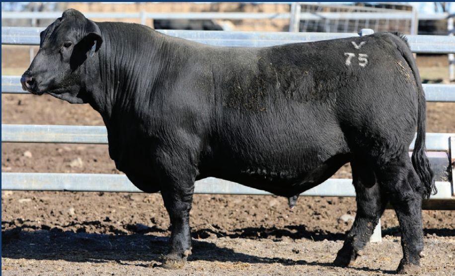
LOT 31 - WOONALLEE HONOR V75