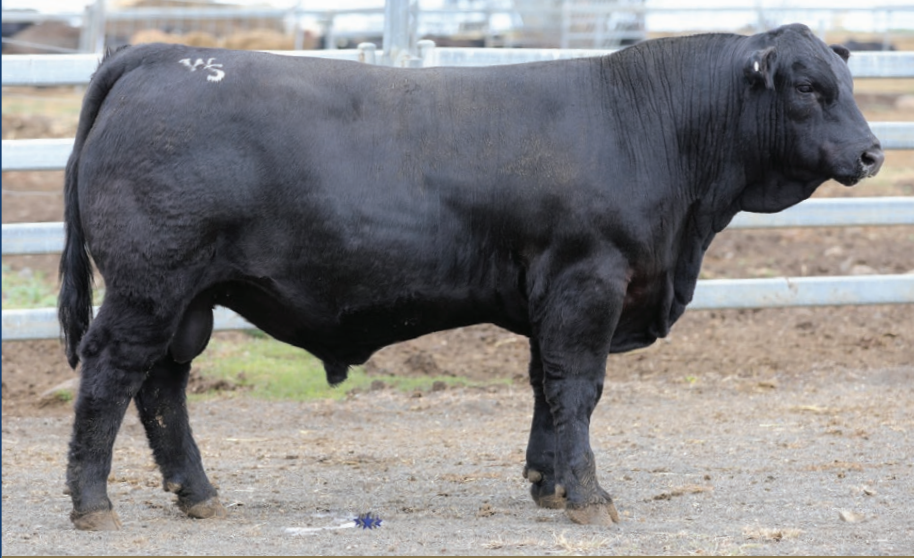
LOT 36 - WOONALLEE PARATROOPER V166