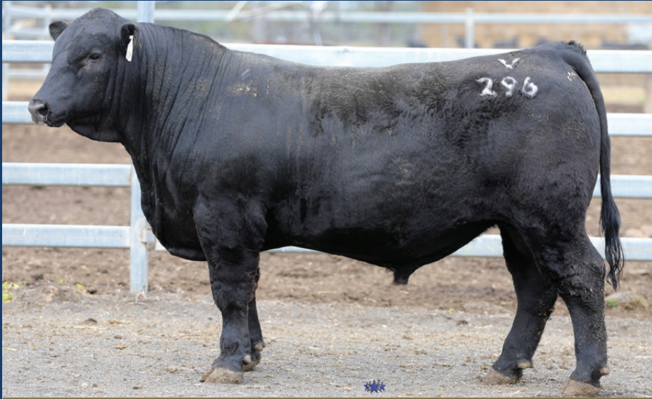
LOT 42 - WOONALLEE REMBRANDT V296