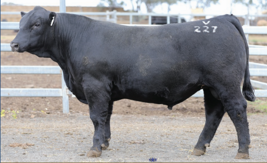
LOT 17 - WOONALLEE GENESIS V227