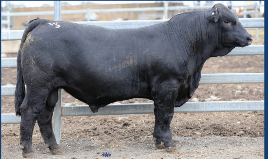
LOT 15 - WOONALLEE SHOW STOPPER V191