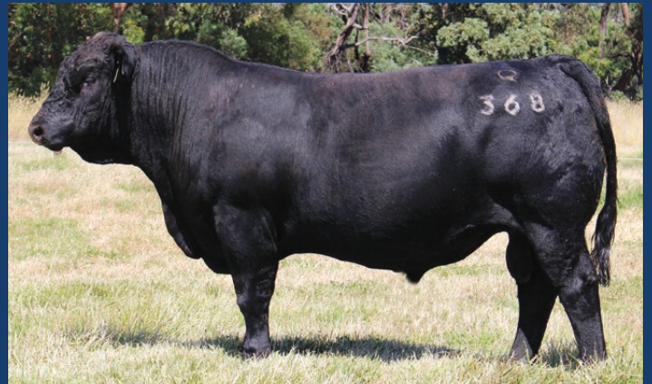
WOONALLEE NOBEL PRIZE Q368