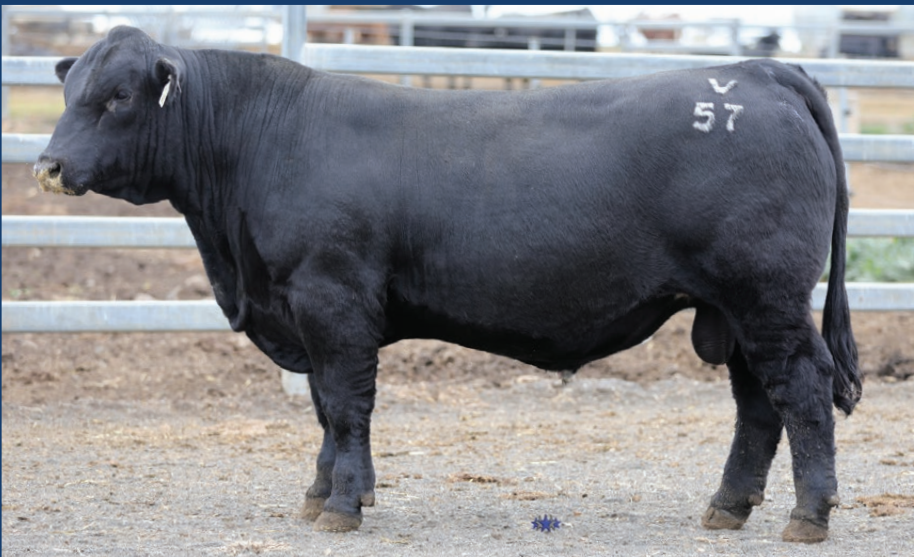
LOT 12 - WOONALLEE HONOR V57