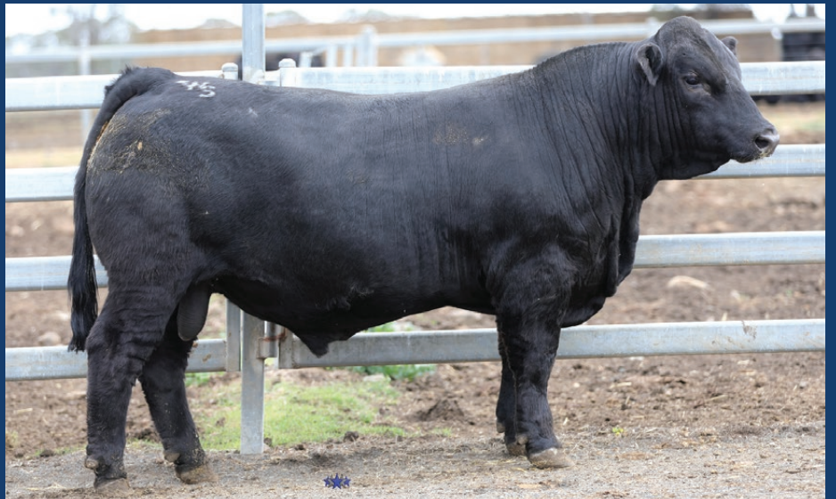
LOT 13 - WOONALLEE SHOW STOPPER V225