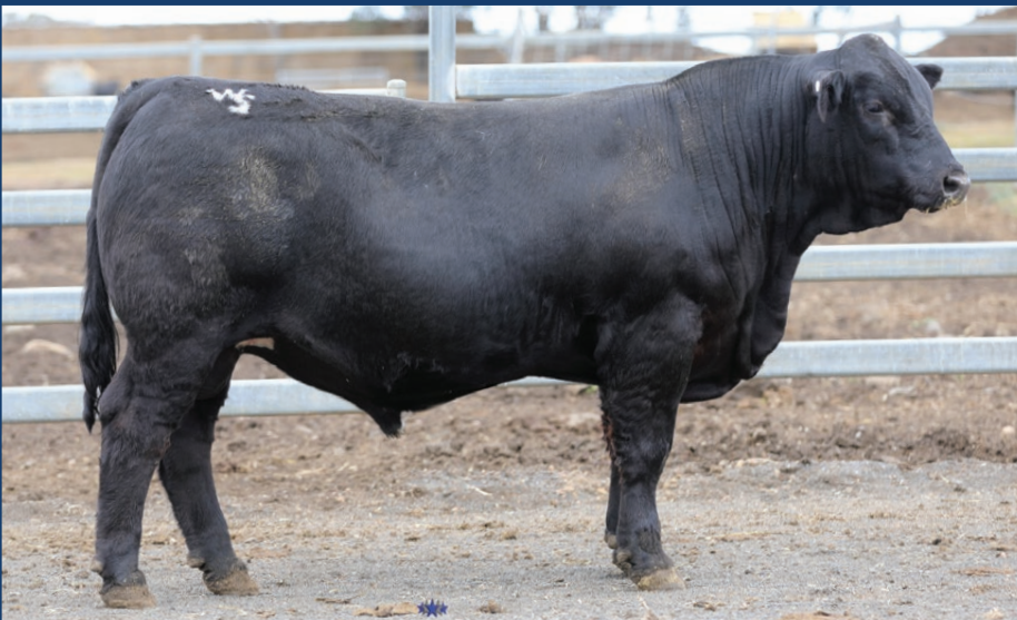
LOT 24 - WOONALLEE NOBEL PRIZE V392