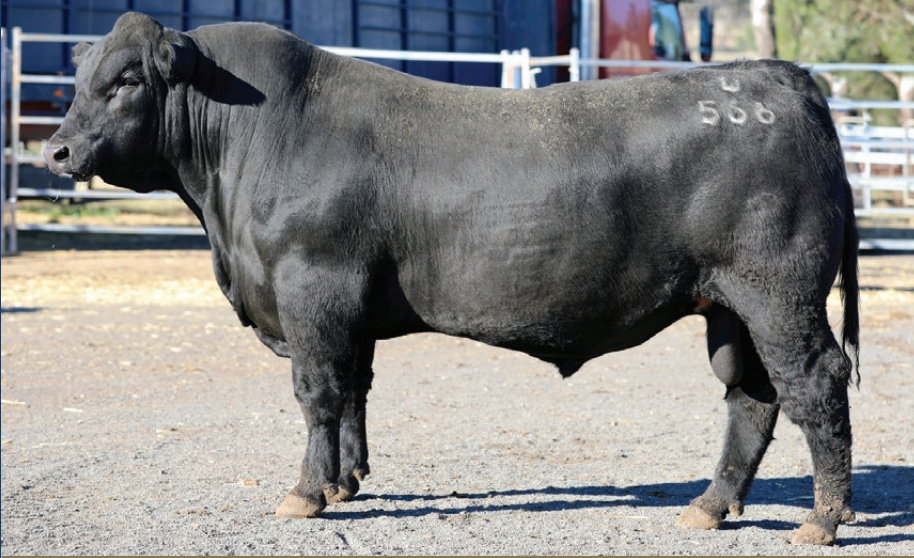
LOT 4 - WOONALLEE CONVERSION U566