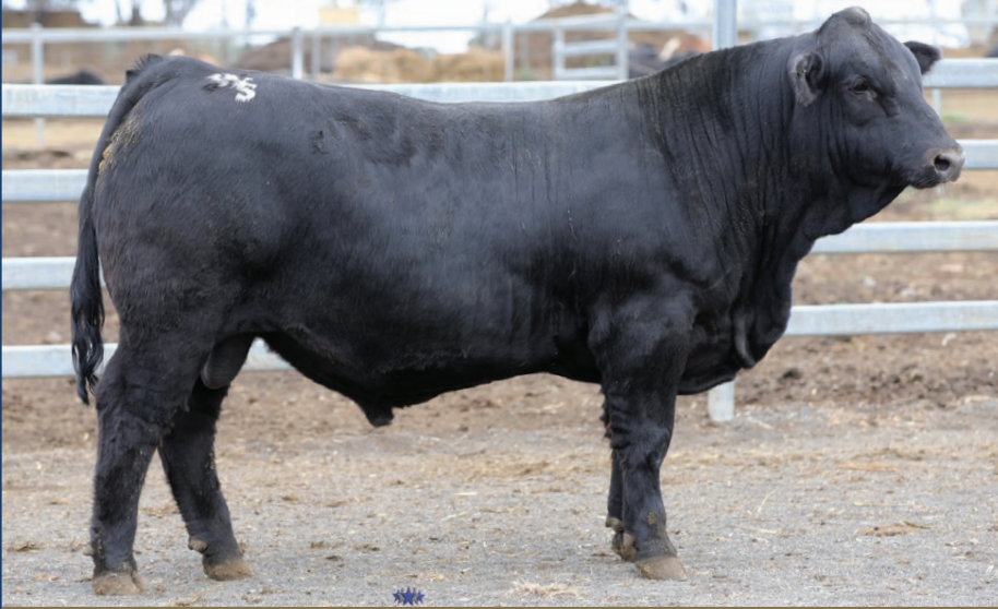
LOT 9 - WOONALLEE NOBEL PRIZE V189