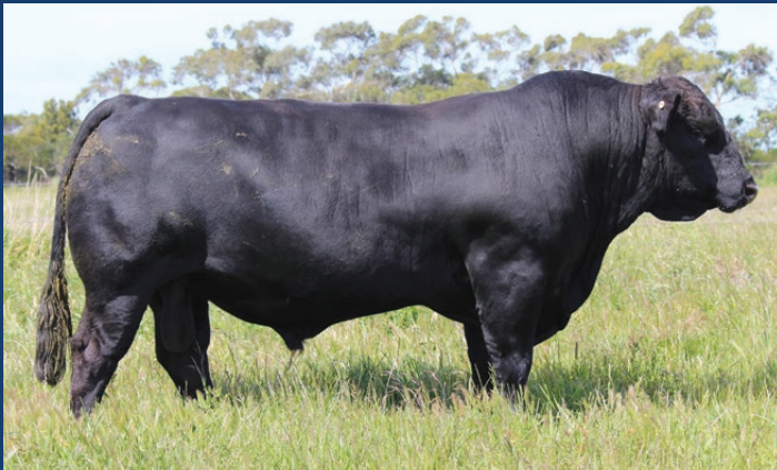
WOONALLEE SHOW STOPPER S126