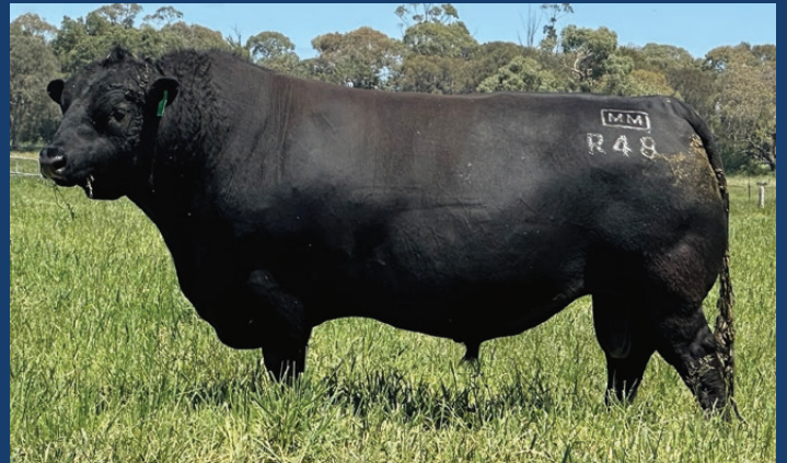
MILLAH MURRAH REMBRANDT R48