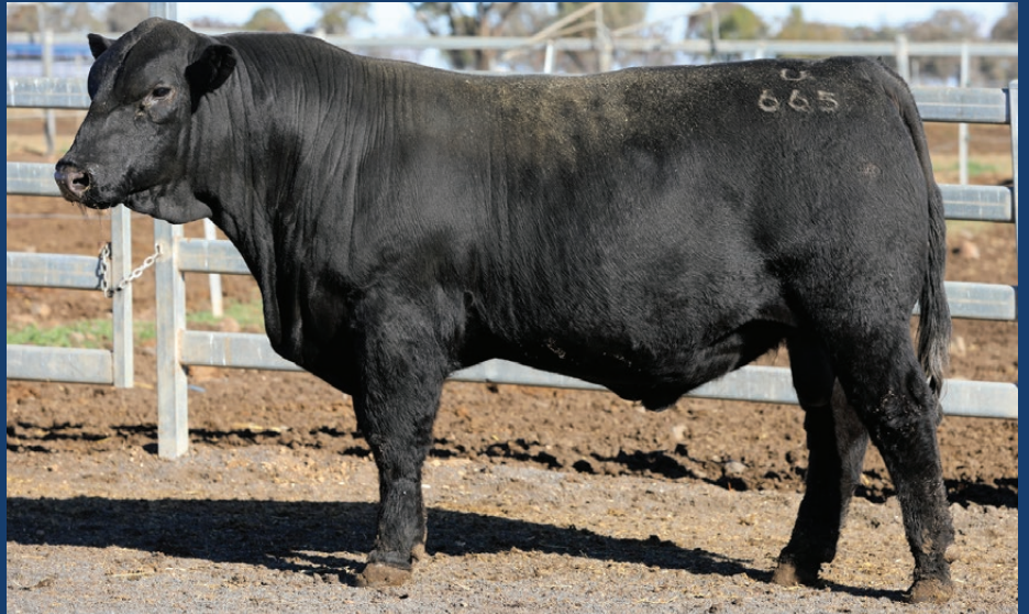
LOT 1 - WOONALLEE SHOW STOPPER U665