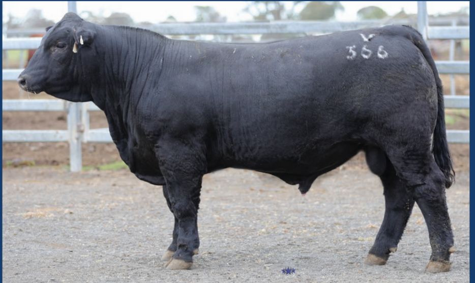
LOT 22 - HIGH FIVE VELOCITY V366