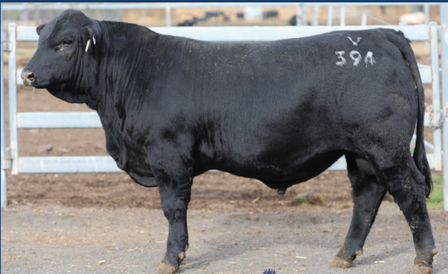
LOT 35 - WOONALLEE REMBRANDT V394