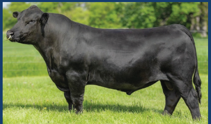
BROWN RRR EMBLEM