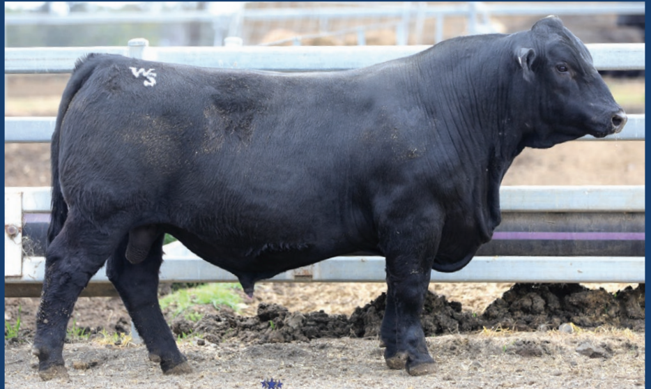
LOT 40 - WOONALLEE SHOW STOPPER V302