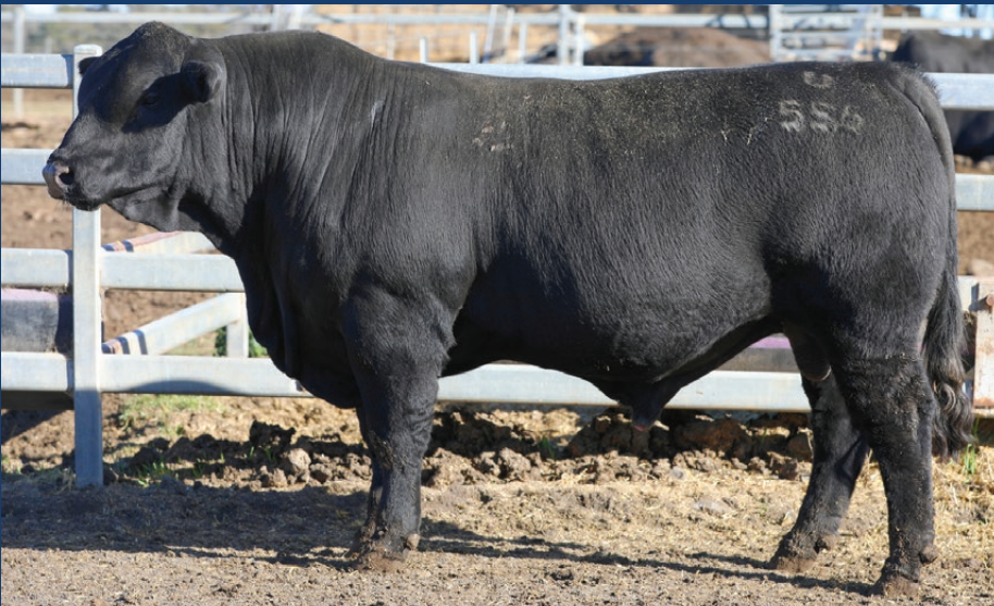
LOT 7 - WOONALLEE MESSIAH U556